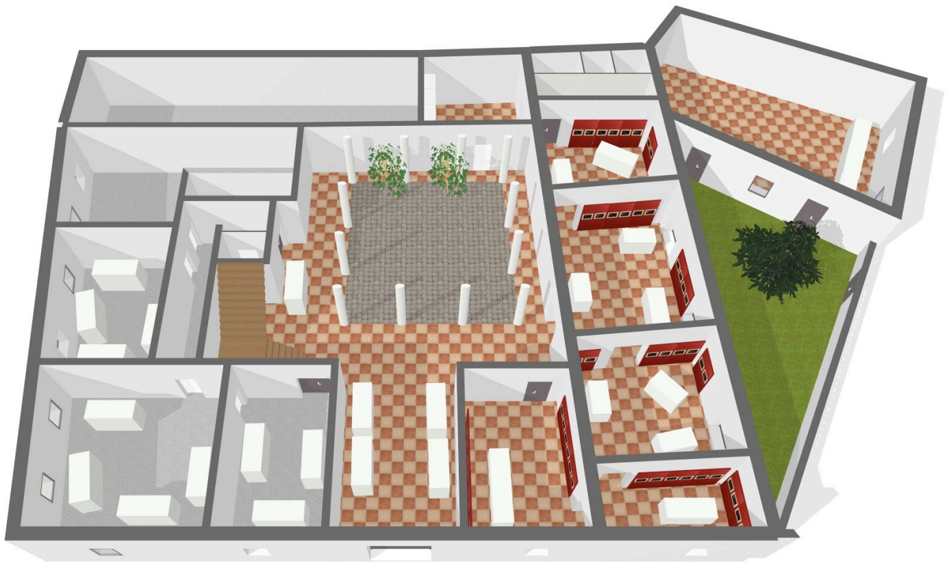
Palazzetto Baviera ground floor, exhibitors' tables on the left and PB-Booths on the right of the main entrance